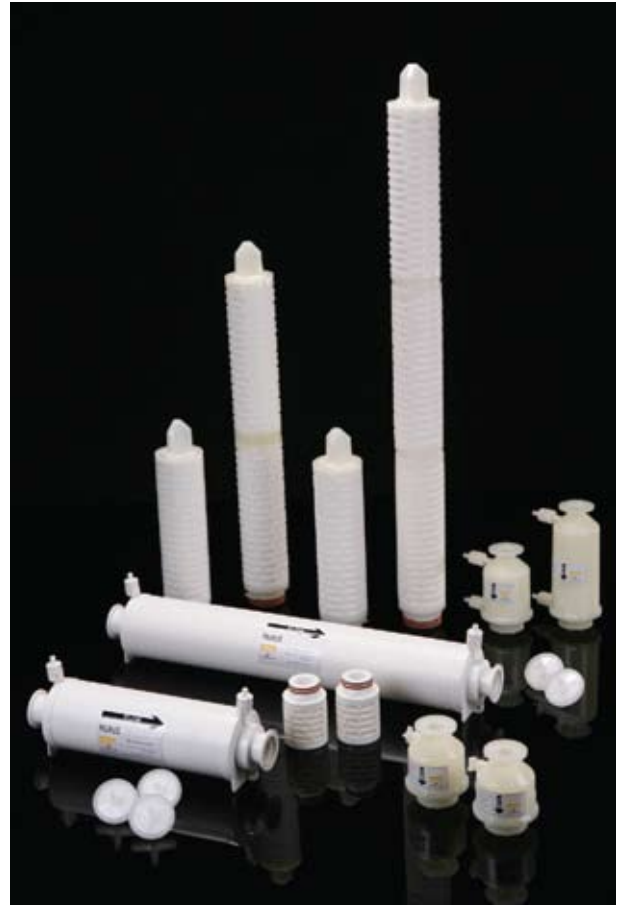
Note: PROCLEAR and DEMICAP are registered trademarks of Parker domnick hunter